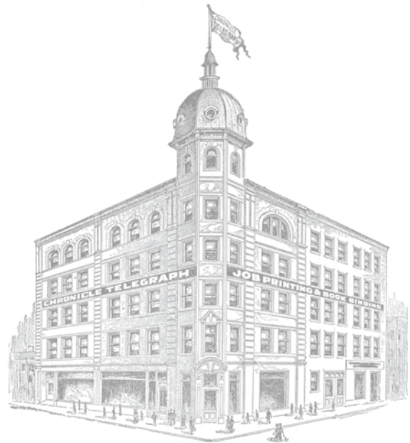
(1924-1959) - 27, rue de Buade, Vieux-Québec

The QCT is a member of the Quebec Community Newspaper Association.